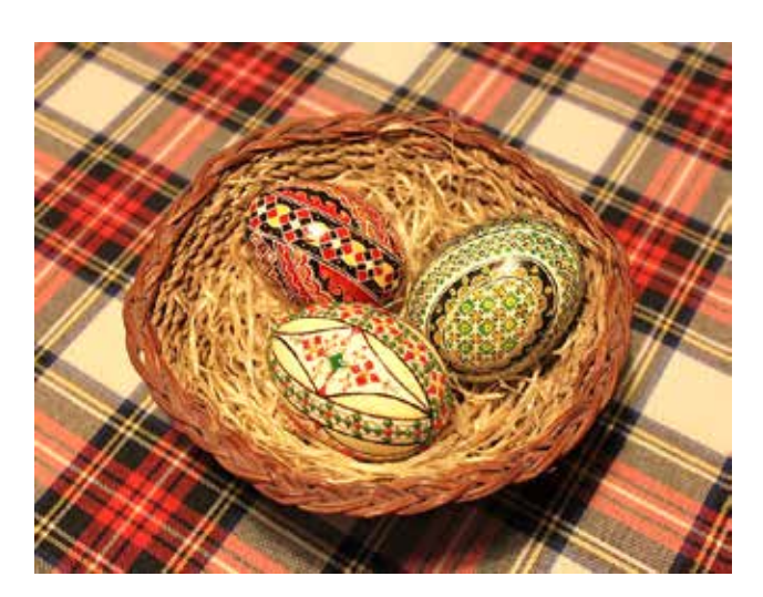
Easter Eggs from Bukovina (2011)

The book is a fascinating contemporary testimony placed within relevant historical context. It was self-published in the spring 2012 and contains 144 pages with many color pictures and documents. The price is 28 Euros plus postage and handling. The book is available from the author: Mag. Karl Lang, Pilgramstr. 5, 4840 Vöcklabruck, Österreich/Austria, telephone 0043 (0) 7672 22800, email mag.k.lang@aon.at.