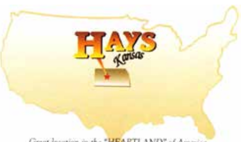
Great location in the "HEARTLAND" of America

Ellis County, Kansas, the German Capital of Kansas, will host its annual Oktoberfest on Friday, Oct 4, 2013. On the very next day, Saturday, October 5, the Bukovina Society will host programs of interest at our headquarters in nearby Ellis. Plans are being made for some social times and meals on both Friday and Saturday evenings.