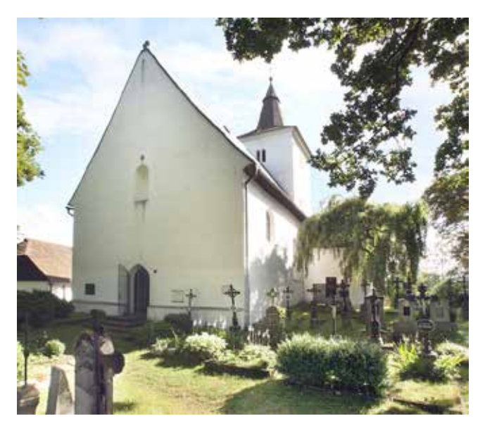
The Roman Catholic Church in St. Maurenzen (2009)

The copyright holder of this file allows anyone to use it for any purpose, provided that the copyright holder is properly attributed. Redistribution, derivative work, commercial use, and all other use is permitted.